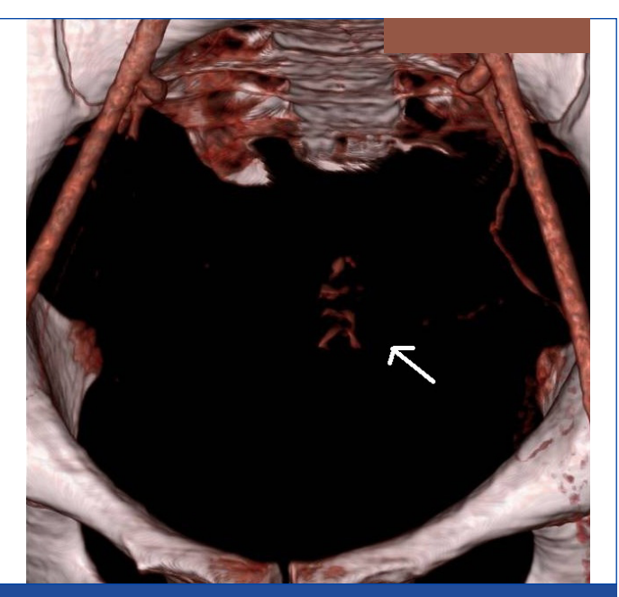
[Table/Fig-3]: Delayed volume reduction CT angiogram showing a pseudoaneurysm (arrow) in relation to arcuate branch of left uterine artery