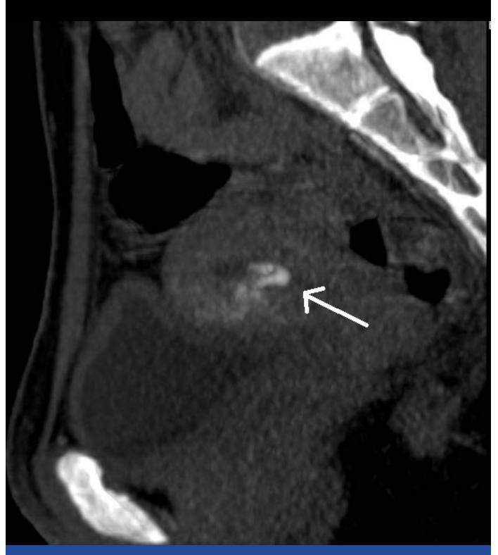
[Table/Fig-2]: Sagital CT angiogram shows contrast filling the pseudoaneurysm (arrow) within uterine wall

To preserve the fertility in this young patient, a transcatheter uterine artery embolization of pseudoaneurysm was planned. She underwent digital substraction angiography. Arteriography revealed a pseudoaneurysm from the terminal part of left uterine artery. In addition, the left uterine artery was tortuous and hypertrophied .Left uterine artery was selectively embolized with a mixture of gel foam and contrast media. The right uterine artery was also embolized. A post–embolization angiographic study was performed to ensure complete occlusion of vessels. Follow up colour Doppler showed aneurysmal cavity filled with echogenic content, with no evidence of blood flow. The patient is asymptomatic at present.